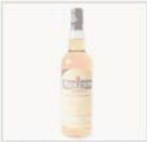
F. Paul Pacult's Spirit Journal Hall of Fame Inductee No. 2' Class of 2011: COGNAC LIQUEUR (France)

No big surprise here. Since 2005, I've called this whisky the Best Spirit in the World for good reason. It is 100% 100% without any doubt in my mind or my experience the finest distilling I've ever tasted, and time and time again it overwhelmingly proves it. The quintessential whisky, to put the ultimate expression of the distiller's art and magic. The greatest distillate of the current generation.